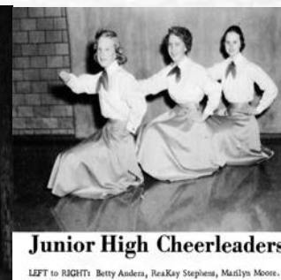
Junior High Cheerleaders